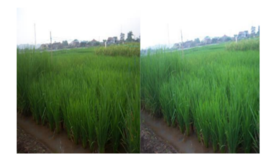
Fig. 2. Performance of agronomic characters of F3 lines selected by Recurrent Selection (RS)

Agronomic characters were observed in a population of RS, as well as the parent is presented in Table 2 and Fig. 2. There was a diversity of agronomic characters in all character observed. Plant height of populations derived Bugis/IR7858-1 and Bugis/IR148 were very tall (>131cm), as same as Sriwijaya/IR148 ranges between 103-140 cm (Table 3). Plant height derived Bugis/IR7858-1 taller than elders. According to plant height standards developed by [20], the population of lines generated Bugis by RS result is more directed at the parent which is between tall to very tall (Table 3). The Sriwijaya as parental had moderate plant height criteria, and Bugis had a very tall, while IR7858-1 and IR148 had criteria between moderate to tall, indicating that the two parents are not stable and there is still segregation between populations.