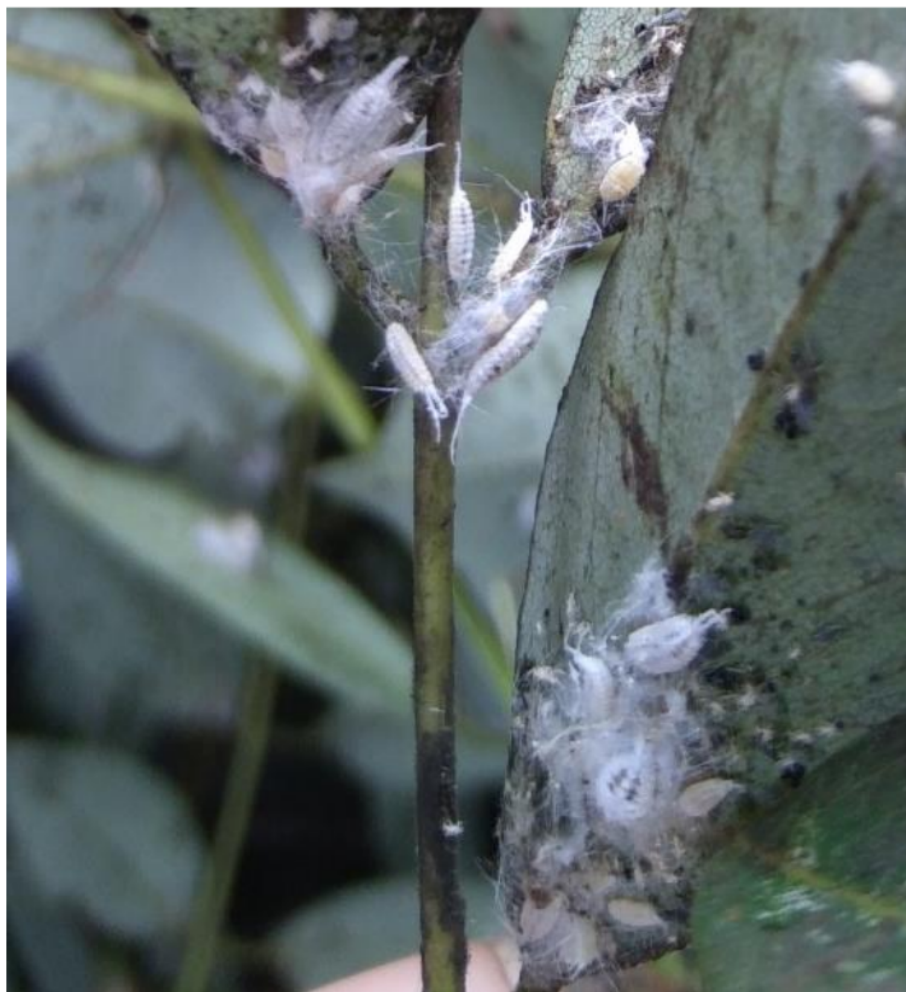
Figure 2. Nymphs and adults of Ferrisa dasyliirii (Cockerell) on the leaf lower surface of Gliricidia sepium (Jacq.) (Fabaceae)

In nature, F. dasyliirii (Figure 3A) is mostly similar to F. virgata in form and size. The species has eight segments antennae with \geq 595 \mu\text{m} long; elongate body oval with 3.10–5.30 mm long and 1.30–2.86 mm wide (Figure 3B) observed the bodies of females cleared of soft contents and the cuticles stained and mounted on microscope slides. They could be easily distinguished from other taxa by their discoidal pores associated with the sclerotized area around the rim of dorsal enlarged tubular ducts on the abdomen. Discoidal pores are situated on the sclerotized area's outer margin and often with pore and its surrounding sclerotization projecting out from the margin (Figures 3C- D).