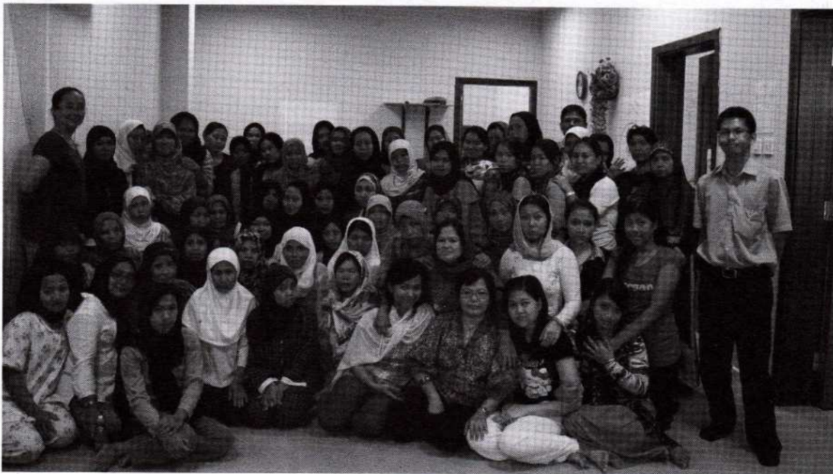
Friends of Migrant Workers at the shelter Embassy in Abu Dhabi, UAE.

crime of rape is perpetrated against domestic workers. It is important to note here, that it is difficult to report this type of crime to the police without a witness. "Justice" is sought by domestic workers through their own rationality, which in turn would worsen the severity of their situation.