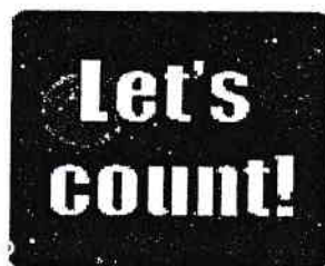
Fig. 3 Example of Picture Book

This site gives the visitors free printable children's books which are very helpful as a teaching aid in the classroom and even at home. Teachers can simply print the small books and read them to the students and even teach them how to read with these attractive and simple books. Each book has a matching audio narration mp3. Teachers can also read the books online with the online reader.