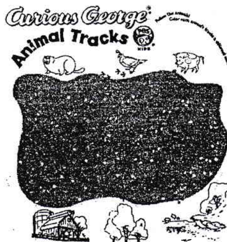
Fig. 4 Example of Students' Worksheet

Besides interactive games, film clips, PBS Kids Go also provides various downloadable materials especially for students' work sheet such as coloring page, cut and paste sheet, connecting the dots sheet and many more. Fig.4 gives an example of the activity of identifying animals' footprint as well as recognizing their homes.